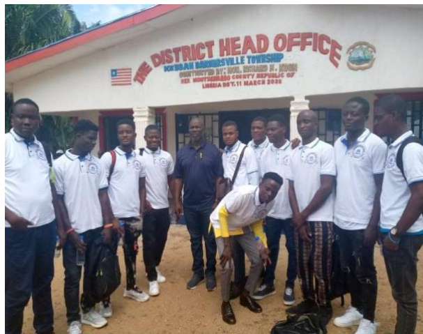
The students visit to the Representative's office.