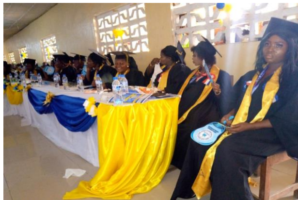
Students on Examination Day